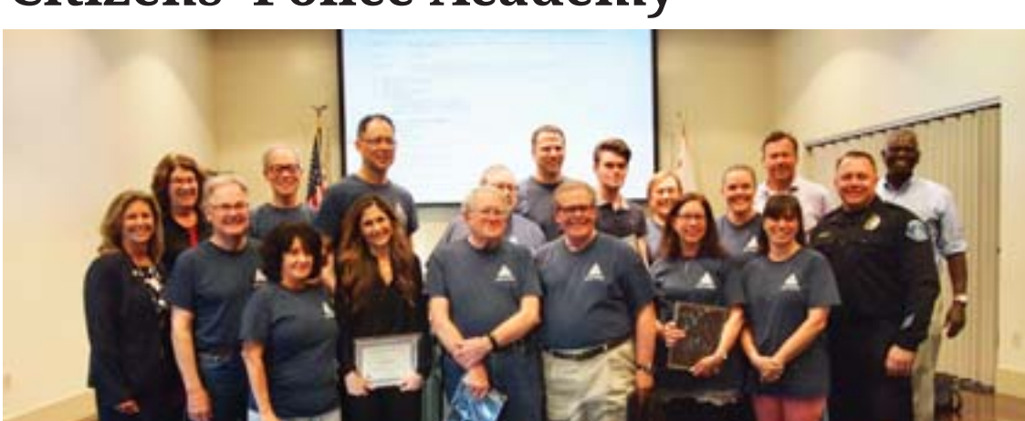
Participants of the spring session pose with the police chief, crime prevention commissioners and the city council April 22.